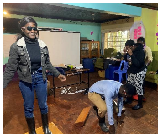
Sensory Integration part 1