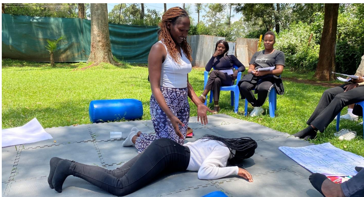
Positioning and Handling