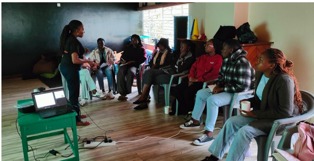
Recap of Sensory Integration session 1

Total cost of the training was Kshs 38,920/= which included facilitation fees, training materials, and meals.