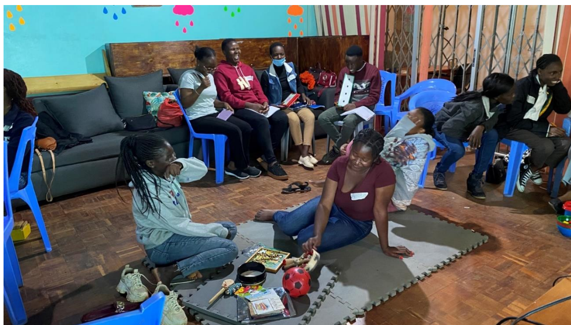
Importance of Play during therapy interventions