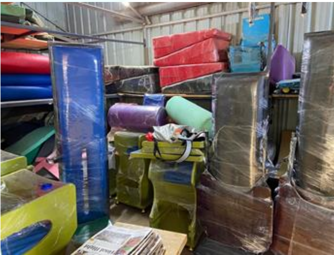
Current State (Langata)

The new center will transform production capabilities, shifting from a cramped workshop to a modern facility designed for efficiency, quality, and innovation.